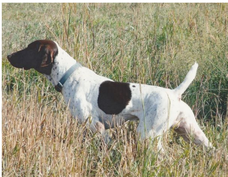
FC Uodibar's Shoot The Moon