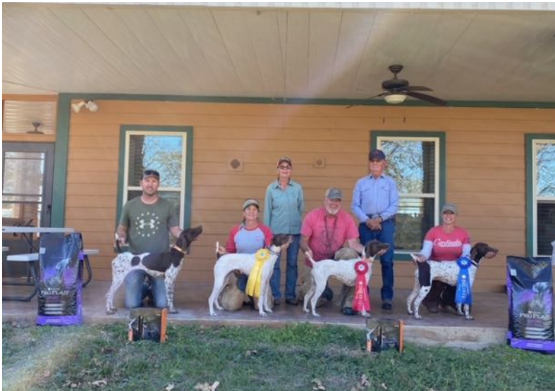
Amateur Shooting Dog Winners

The NGSPA Texas Championship took place on November 16-19, 2020 and was held at the Navasota Ranch in Iola, Texas.