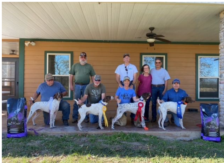
All Age Winners