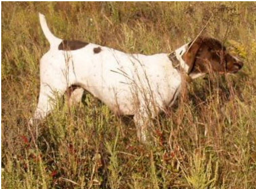
NFC GFC FC AFC MSR'S OPALESCENCE

6/27/2006 - 10/22-2016 2011 & 2014 GSPCA National All Age