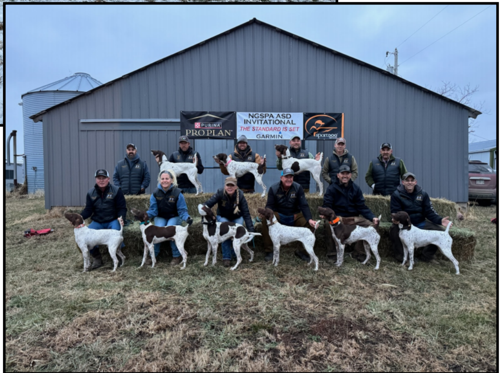
2023 NGSPA SHOOTING DOG INVITATIONAL CHAMPIONSHIPS