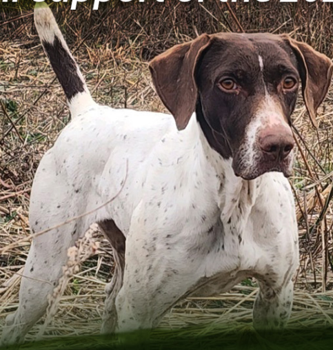
Open All Age Chicoree's Riden High Trixie "Trixie"

"The Invitationals wish to thank everyone for their support of the 2023 NGSPA Nationals"